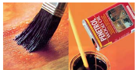
Makes a great wood primer