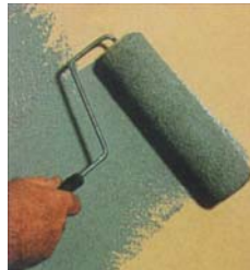
Apply with roller.