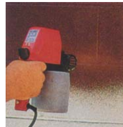
Apply with sprayer.