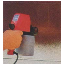
Apply with sprayer.