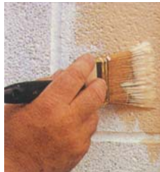
Apply with brush.