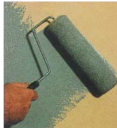
Apply with roller.